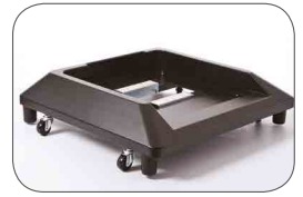
Stabiliser Unit (SB-7100) Recommended when 2 or more optional lower trays are installed for increased stability