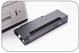
Replacement Ink Cartridge (HC-05BK) Approx. 30,000 pages 1