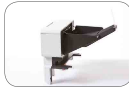
Output Stacker (MX-7100) Up to 500 sheets (maximum of 1)