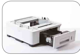
Optional Lower Tray (LT-7100) Up to 500 sheets (maximum of 3)