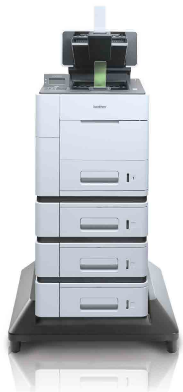
HL-S7000DN100G2 – 100ppm