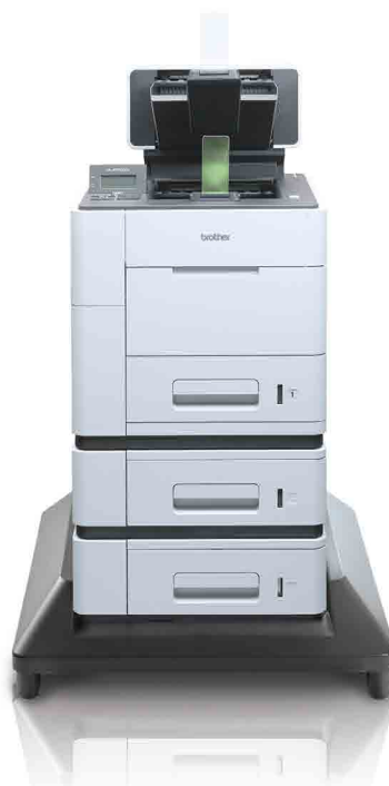
HL-S7000DN70G2 – 70ppm