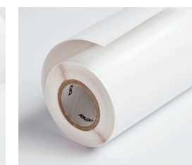
RD-M03E1 Label roll (72 labels) 101.6mm x 152.4mm