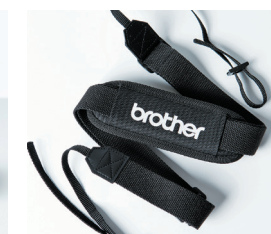
PA-SS-4000 Shoulder strap