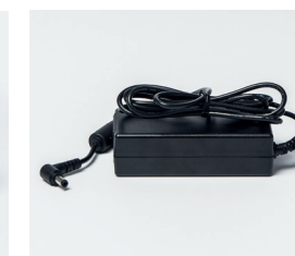
PA-AD-600 AC adapter EU and UK version available