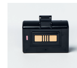
PA-BT-006 Rechargeable Li-ion smart battery