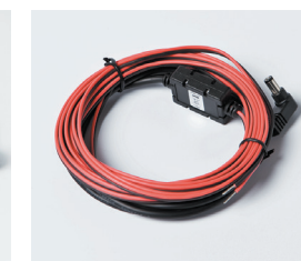
PA-CD-600WR Permanently wired