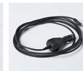
PA-CD-600CG Cigarette plug