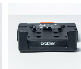
PA-CR-002 Single charging cradle