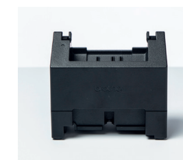
PA-BC-003 Single battery charger