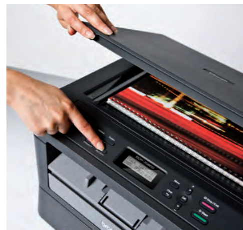
Scan colour documents direct to your PC

The DCP-7060D comes complete with a range of easy-to-use software utilities to improve your productivity. Bundled with the powerful Scansoft® Paperport™ document management software, hard copy documents such as invoices can be scanned in colour, stored and managed electronically for future retrieval.