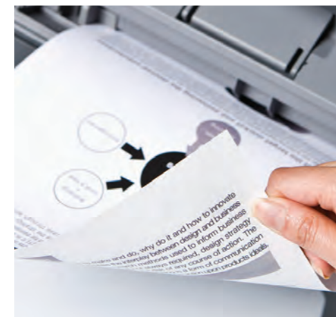
Automatic 2-sided printing to reduce print costs