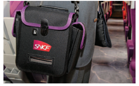
The MPrint can easily be incorporated into a custom made carrying case