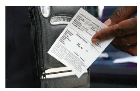
Small and compact enough to comfortably fit in the hand