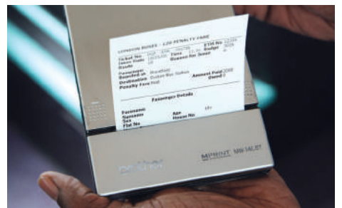
Penalty fare notices can now be issued on-the-spot due to the MPrint's compact size

Business Systems and Development Manager Transport for London Buses