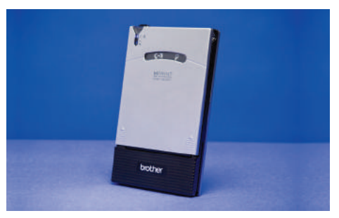
MPrint offers the convenience of portable printing on demand, wherever you work