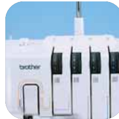
4 colour easy threading guide